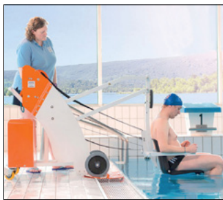
SIMPLE TO LOWER AND LIFT