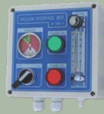
VACUUM TRIGGER BOX

Aqua pop I and II are wall mountable, air cooled, very ultraviolet (VUV) radiation type, ozone generator units, specifically designed for swimming pool applications. The system incorporates VUV type Ozone generator(s), vacuum trigger box, PVDF check valve, venturi injector and manifold. The ozone contacting vessel and degas valve are optional. These packages are capable of producing ozone in 2g/hr and 4g/hr.