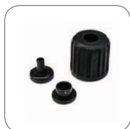
Per valvola 3/8" For 3/8" valve